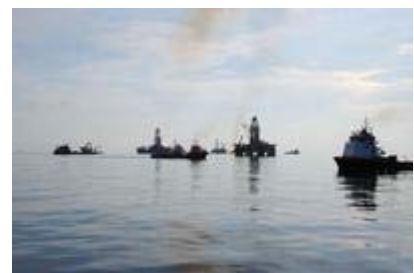
Ships gather at the site of the Deepwater Horizon oilspill