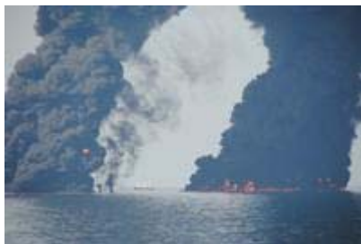
Burning oil on the surface of the Gulf