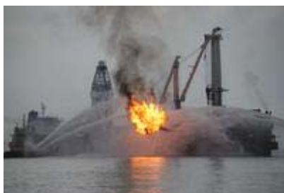
Gas is burned off from the containment ship as others spray water to cool temperatures