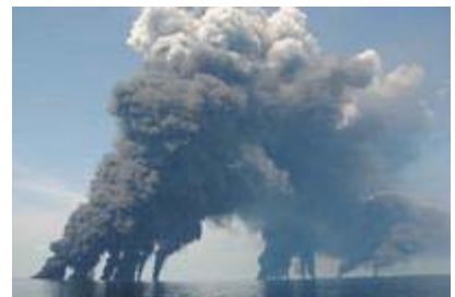
More smoke from burning oil