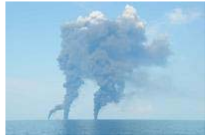
Surface oil being burned in the distance