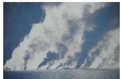
Smoke plumes from burning oil