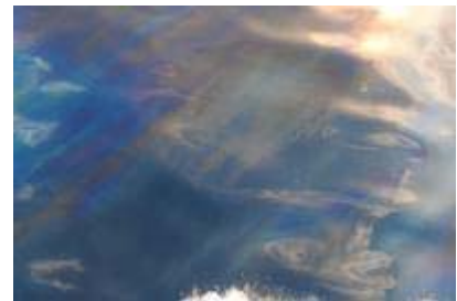
Oil sheen on the Gulf waters