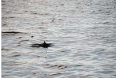
A lone dolphin swims in oily Gulf waters