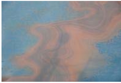
Oil fouling Gulf waters