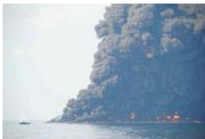
Smoke from burning oil