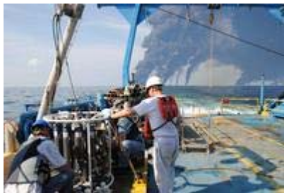
Research while oil burns in the background

As part of the controlling efforts for this event, BP, the Coast Guard and a unified command systematically launches a series of procedures to mitigate the effects of drifting oil. This includes the application of dispersants and burning systematically oil slicks that contains big mass of oil. To conduct this controlled burning of the oil slicks, the oil has to drift away far enough from sea operations. Here a series of photo collections courtesy of Leigh Stevens and Oscar Garcia. The closest distance from the RV Brooks McCall to the fire was 1 mile.