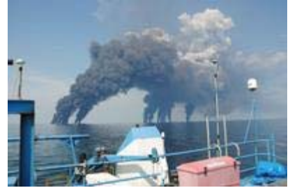
Burns a mile from the ship